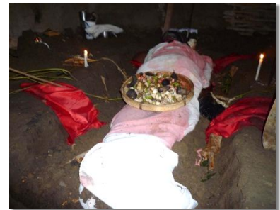
A woman seeks healing at a Voodoo ceremony.

3. Haiti needs godly leaders who will prioritize the good of the nation and address its massive problems. Two centuries of misrule, tyranny and recent flawed democratic attempts have brought hopelessness and despair. Corruption is rampant, and robberies and kidnappings commonplace. The economic plight of most Haitians deepens each year, exacerbated by the events of 2010. Many seek to escape, some physically, by fleeing the country in unsafe and leaky boats, others emotionally through taking drugs. Pray that men and women may be raised up that will reverse these trends and establish justice, righteousness and long-term stability.